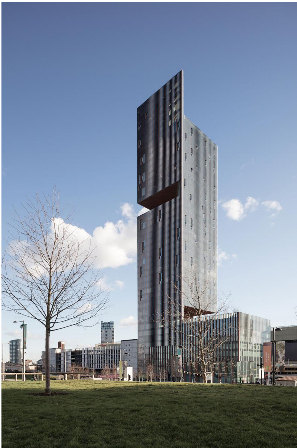
Manhattan Loft Gardens is housed inside a 42-storey double-cantilevered tower, by architects Skidmore, Owings & Merrill (SOM).