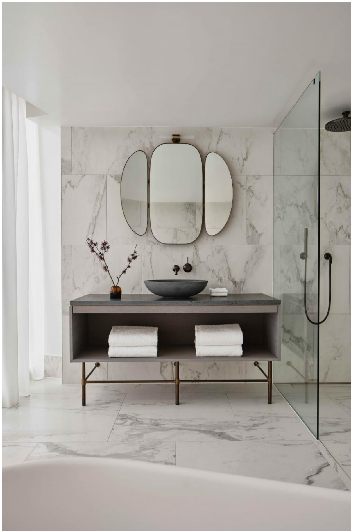
Danish design studio, Space Copenhagen have layered the hotel's interiors with softly curved bespoke furnishings.