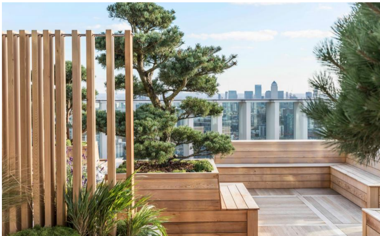
The hotel's other standout features include three cedar-lined landscaped Sky Gardens with sprawling London views.