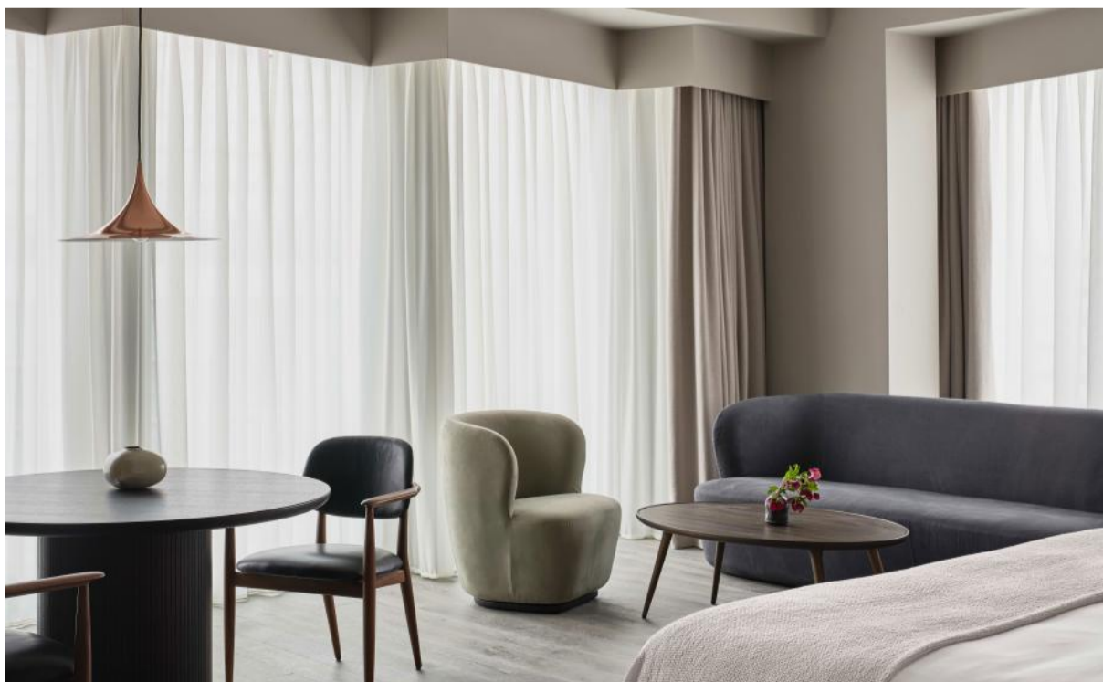
Located in East London's Queen Elizabeth Olympic Park, the hotel joins The Lofts as the final piece in the Manhattan Loft Gardens project.