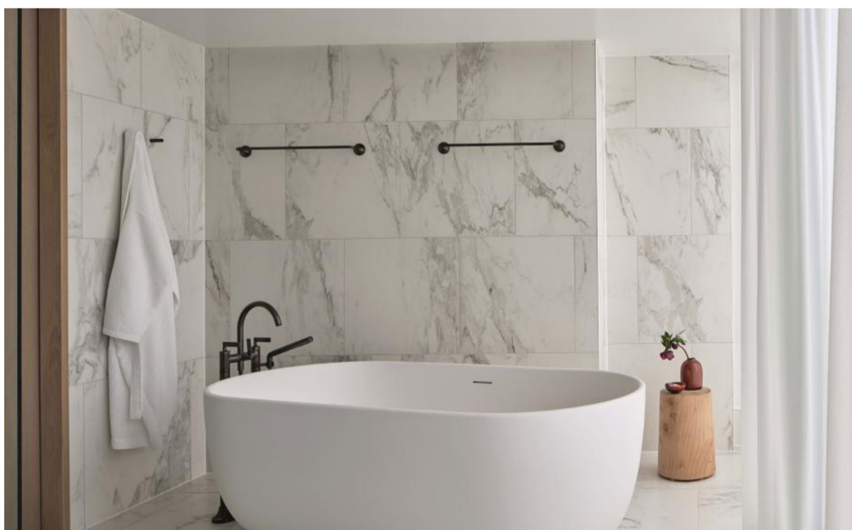
Natural light bathes the spaces which are dressed with rich, tactile materials.